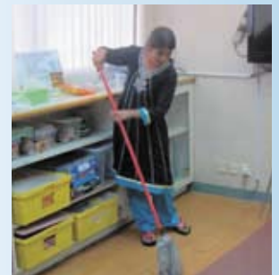
It looks like they learned something after all!