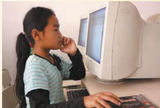
Character education in action in China. Kids learn to be concerned for others as they learn computer skills.

I am learning how to be concerned for others—how to pay attention to other people's feelings. I am learning that I need to humbly accept other people's input, be tolerant of other's shortcomings and accept our differences. I need to live in harmony with the world."