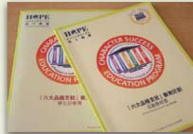
We translated and adapted the curriculum from Character Counts! for the local context.

caaring, citizenship, and fairness. By supporting HOPE worldwide, you are bringing the Character Success Education Programme to the underprivileged in Hong Kong and China. In 2009, we became a coalition member of Character Counts!, the biggest character education programme in the USA. Thanks to you, we were able to send 2 staff to attend their training, as well as translate and adapt their curriculum for our use in the local context. For the past two years, we have been steadily threading the curriculum into many of the programmes and activities at our Centre for Kids, and seeing encouraging results.