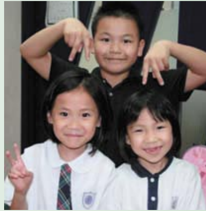
At the centre, the older kids learn to care for the younger ones.

One day as I stepped out of the washroom, I saw an older boy taking a small young girl by her shoulders and escorting her to the water cooler. "Get a cup and get some water, quick!" She did so. He then half pulled her to the washroom sink and ordered her to rinse her mouth. He then bent over, looked into her mouth and announced, "It's OK now." She had lost a tooth (just the age to be losing her baby teeth) and a little bit of blood had come out. They were in the middle of the homework tutorial session when this happened. I was so impressed by him and praised him for being so caring. He did not say anything, but I could almost tell that he was walking a little straighter and holding his head a little higher as they headed back into the classroom.