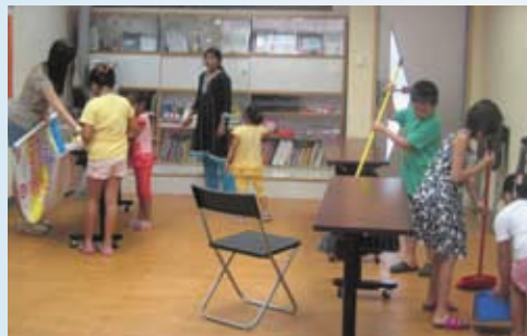
Kids initiated to clean up the centre after one of the lessons and parties.

It looks like they learned something after all!