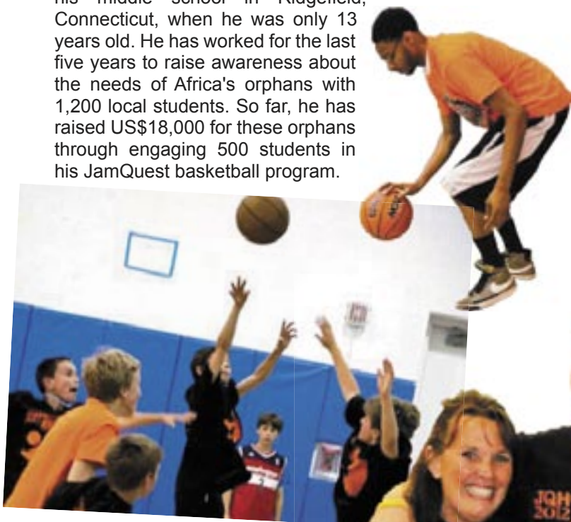
Participants, young and old, bring hope to orphans in Africa.

It is amazing to see what a difference one person can make in the lives of orphans in Africa.