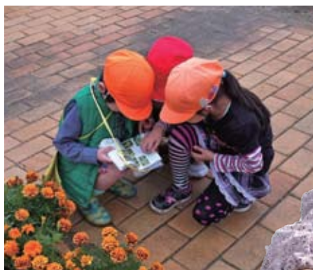
The HOPE worldwide Therapy Garden draws visitors, young and old, from the local community.