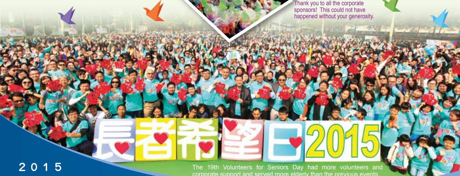
Thank you to all the corporate sponsors! This could not have happened without your generosity.

What did these have in common and what did they have to do with Volunteers for Seniors Day? They are also part of the "heart-ware" that went into making this year's event successful. Members of the Hong Kong Venture Capital and Private Equity Association got creative in their fundraising. They came together and played "beer pong". Proceeds from the evening were donated to Volunteers for Seniors Day.