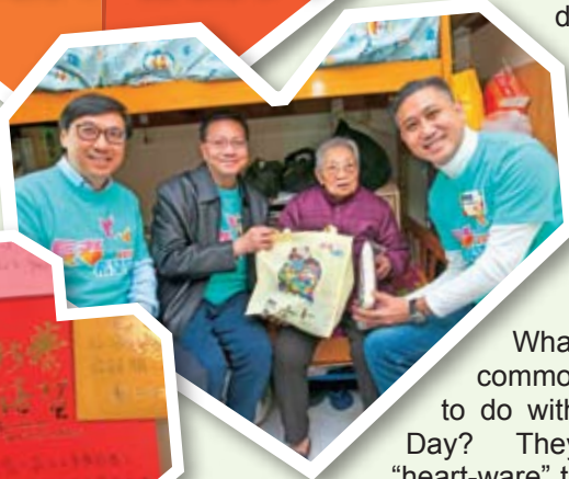
Thank you, Professor Anthony Cheung Bing-leung, for coming to encourage our volunteers for the third consecutive year.

Without you, there would be no "heart-ware"!