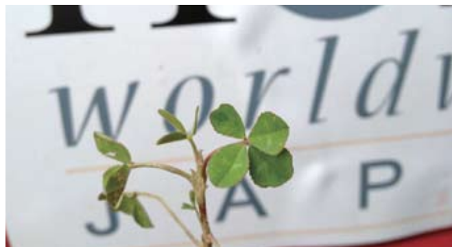
HOPE worldwide Japan uses horticultural therapy to help tsunami victims recover from their traumatic experience.