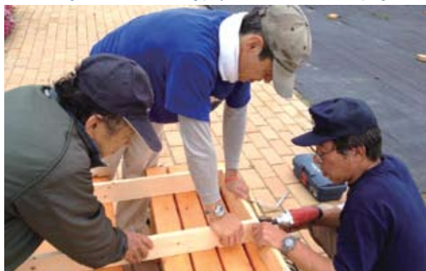
The staff began a furniture-building project to attract men to the programme.

In 2013, over 2,600 people benefited from therapy classes growing flowers, vegetables, and crops.