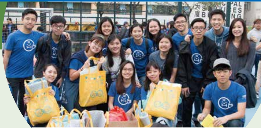
On Volunteers for Seniors Day 2019, this group of young people had to overcome their fears in order to clean up an elderly woman’s home. Their service touched her heart and changed her life.

They spent five hours scrubbing the floor, the walls, the bathroom, the kitchen, a door, and whatever they could tackle. When it became late in the day and there was still much to be done, they called in another group to help.