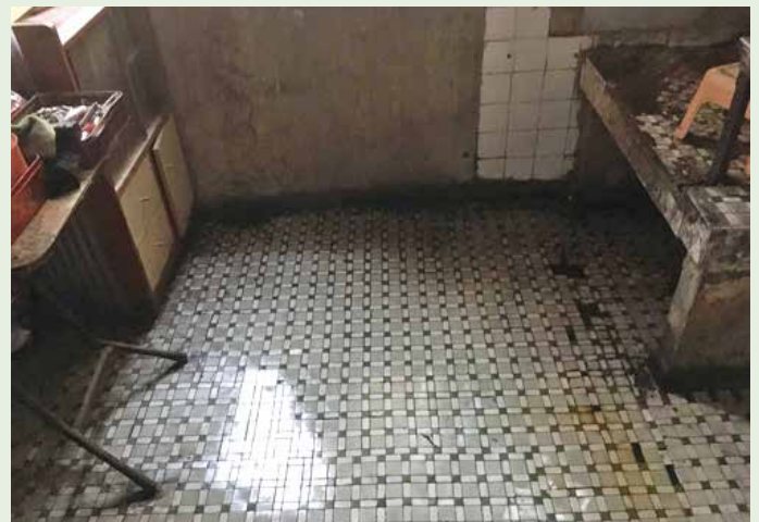
Light finally shone into the home of the elderly woman after hours of hard work by the volunteers.

After hours of hard work and many buckets of dirty, black water dumped away, retro style floor tiles began to emerge. The door which the volunteers thought was a dark brown colour started to show that it was actually a soft shade of silver. Eddie and his friends began to see light shining into the apartment.